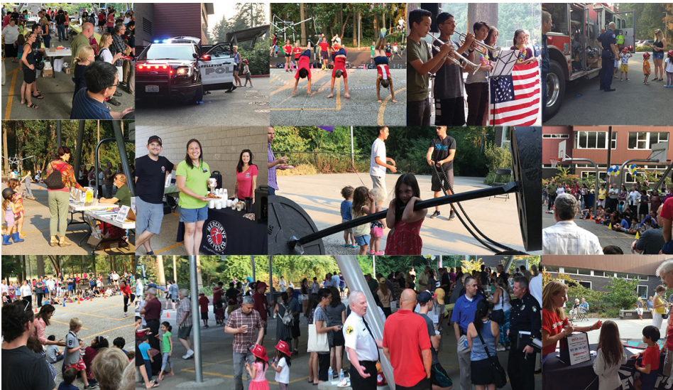
The Eighth Annual Night Out was enjoyed by over 300 residents! Special thanks to all the sponsors who came to the event. Neighbors appreciated getting to know the visiting businesses and food sponsors. Thanks to All of Our Sponsors and Friends!

BTNO is an annual event hosted by the Bridle Trails Community Club. Plan to join this excellent community event at Cherry Crest School in August 2018.