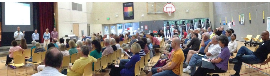
BTCC's May meeting was filled with questions for PSE concerning the Energize Eastside project.

Sound Transit OMSF site selected on Northeast 12th Street on the east side of the former BNSF railway corridor www.soundtransit.org