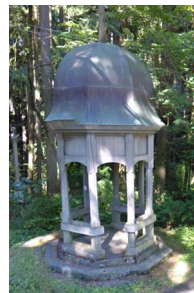
Gazebo Aug 2011

Last March, around 11:00AM, a driver fell asleep at the wheel and hit a tree, causing her car to roll onto the side of Parkside's gazebo. The driver and her baby escaped from the wreckage unscathed. Parkside and the City of Bellevue are working together towards the restoration of our Bridle Trails landmark. Near the "S" curves along 132nd Ave NE and 134th Ave NE, the gazebo has served as a school bus stop shelter twice a day and has been a valued landmark for 42 years for all Bridle Trails residents and Park visitors.