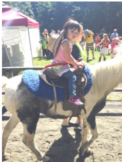
Fun from last year's Party In The Park

Celebrate our beautiful Bridle Trails State Park, have fun, and support the Bridle Trails Park Foundation, including 50% of the uncovered operating costs of the Park.