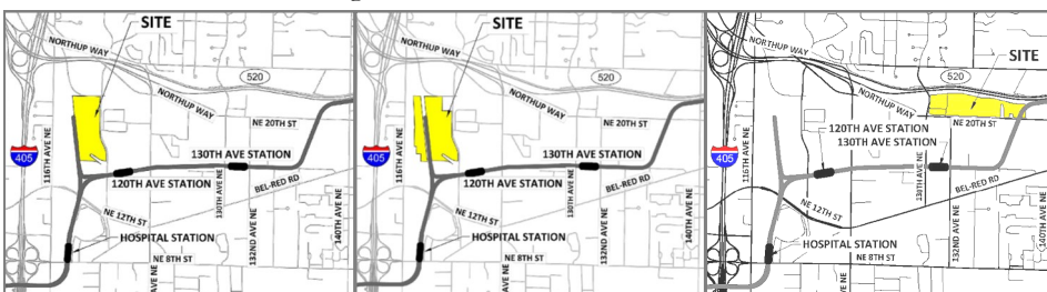
Alternatives 2, 3, & 4 (Bellevue) to be evaluated in the Draft Environmental Impact Statement for the location of the Link Facility Excerpted on 3.1.2014 from www.soundtransit.org/Projects-and-Plans/Link-Operations-and-Maintenance-Satellite-Facility/Locations--Link-OMSF

BTCC encourages all BT residents to be aware of the OMSF developments and to attend our March 20 meeting.