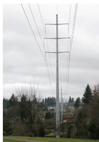
Sample Pole and Wiring Configuration Pole heights will range from 95 ft to 125 ft : energizeeastside.com/design