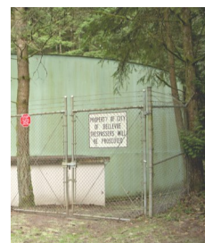
Reservoir in State Park

As the DEIS publication approaches release, ST will send a 5-week notification letter to properties that would be potentially impacted and provide wider