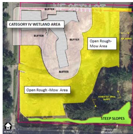
Site Layout with Critical Areas - Mar 29 Presentation Approx. one acre of level, developable land