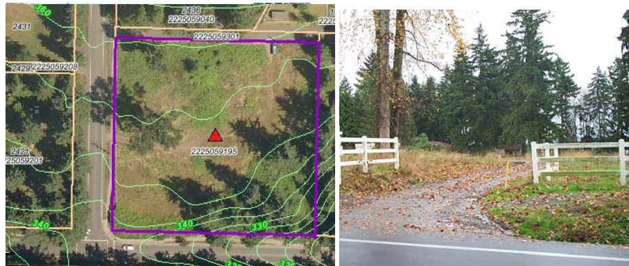
Property Location at Ne 24th and 134th -King County Property Information